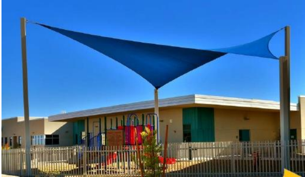
2X Cantilevered GORILLABrellas