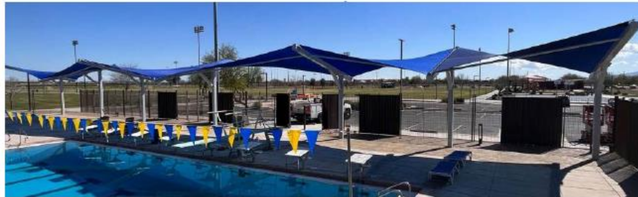
Cantilevered Shade Structure